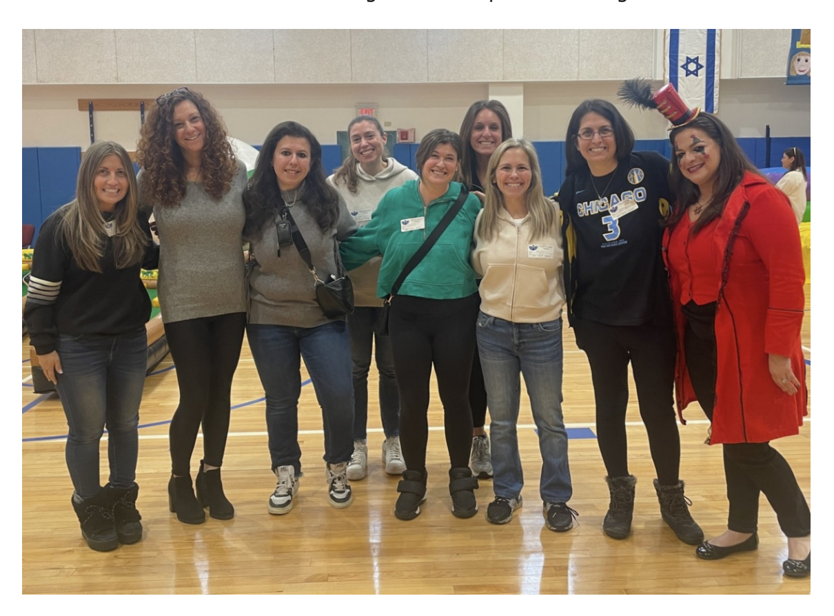
Thanks to our tzevet and parent volunteers for making the day so fun for students!

Last Friday, Schechter was the place to be as students and tzevet (faculty and staff) celebrated Purim with imaginative costumes, singing, dancing, and carnival fun. Beyond the celebration, our K-8 students embraced the essence of Purim by exchanging mishloach manot and participating in the mitzvah of Matanot L'evyonim . Each grade contributed canned food and other items to donate to The Ark to help individuals and families in need throughout metropolitan Chicago.