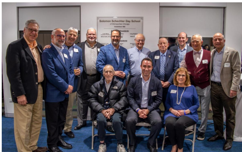
Board presidents stand together in front of the new plaque paying tribute to our visionary leaders.